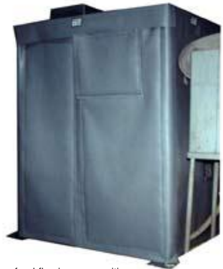
Custom feed-flap in open position (Left photo) and closed position (right photo) protects operator during loading.