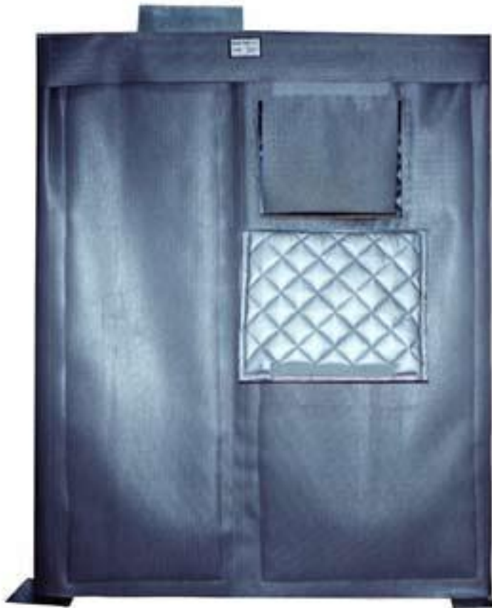
Curtain enclosure constructed of ANC - BBC-13-2" reduced noise levels by 22dB (A).